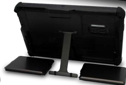
2 Hot-swappable batteries.